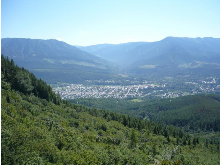
2 nd big climb of the day, up Kill Phil to Stupid Traverse...