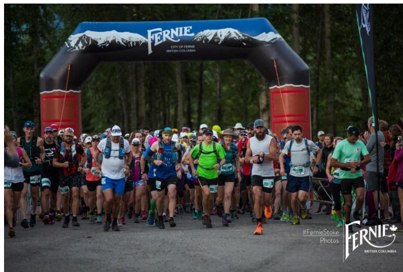
Welcome to the 2019 start line!

Please email abimoore2011@outlook.com for any of the above.