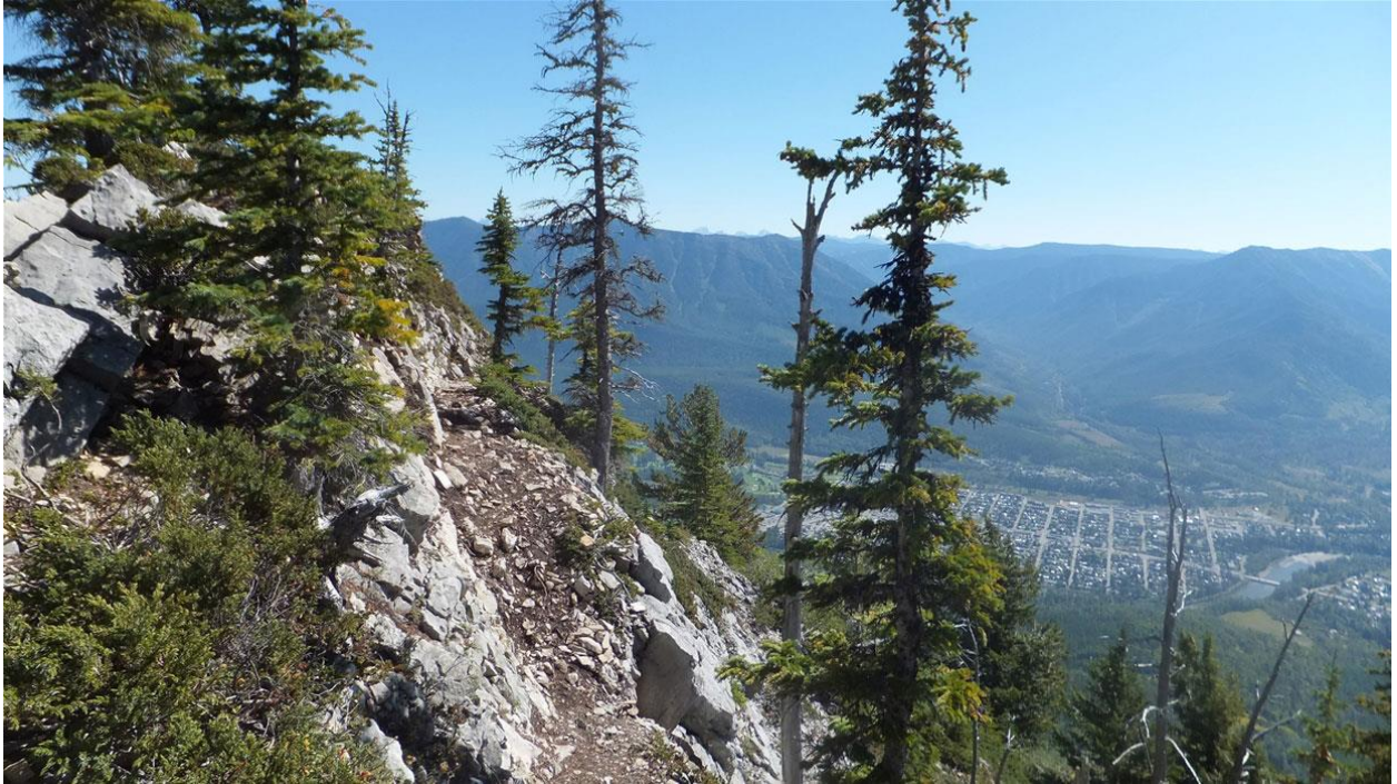
Sweet views and exposed trails, at the top of Mt. Fernie!

Each TA will have a fully stocked Aid Station and Soloists will have the option to have drop bags at both.