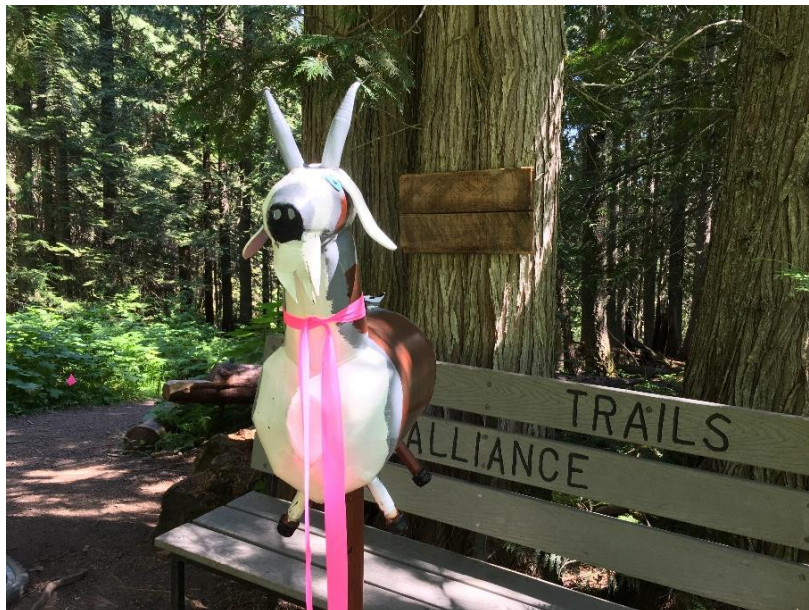
The Goat knows. Follow the pink flagging!

* Please note, TA2 Drop Bags won't be returned to the Finish Line until late in the day. If you're in a rush to depart or have something you need, we advise you arrange for your support to pick up from TA2 after you've passed through. TA1 bags will be back by ~1PM.