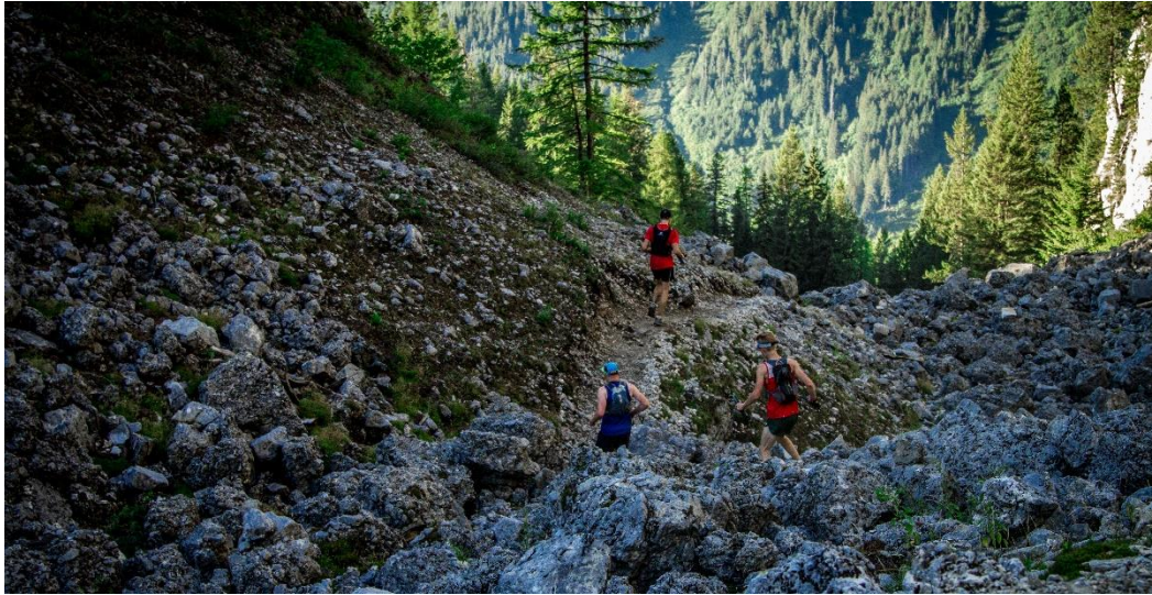
Running down through the Rock Garden, from Windy Pass down to Island Lake Lodge...