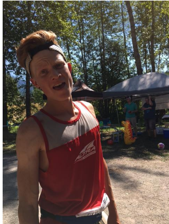
What just happened? (Actually, he killed it. 2 nd place Male 2017!)